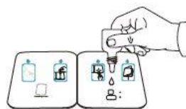
Step 2: Add 5 drops of buffer to well A.